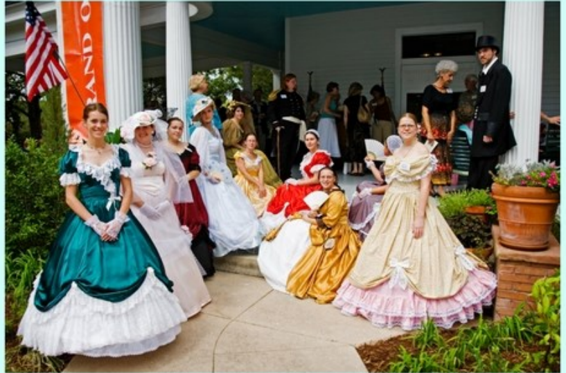
Photo from the Grand Opening 9-23-2006

1428 ELEVENTH STREET • HUNTSVILLE, TX 77340 936-291-5424 OR THEWYNNEHOME.COM